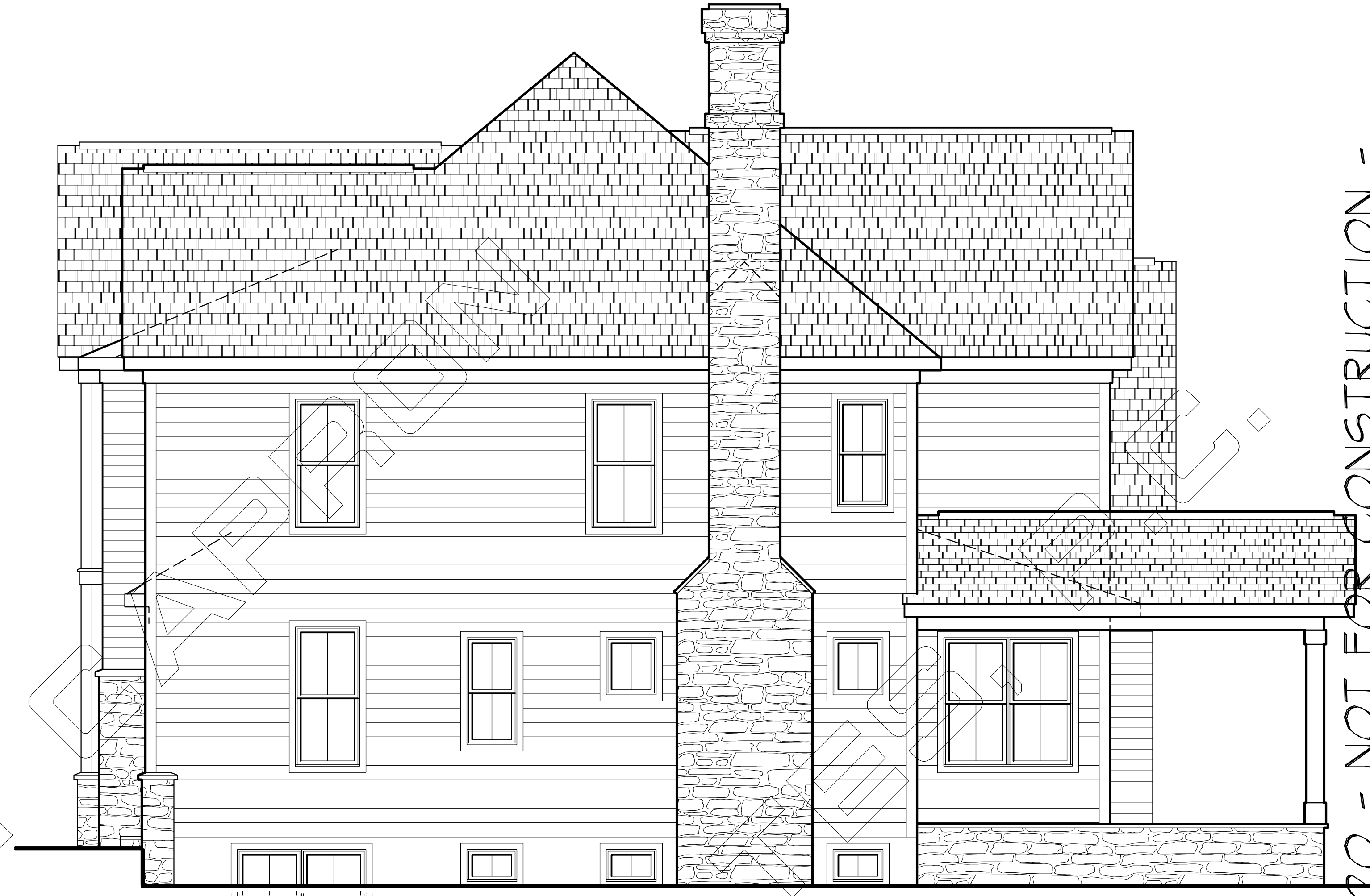
RIGHT ELEVATION 1/4" = 1' - 0" \\boca\743parks\db\right.dwg