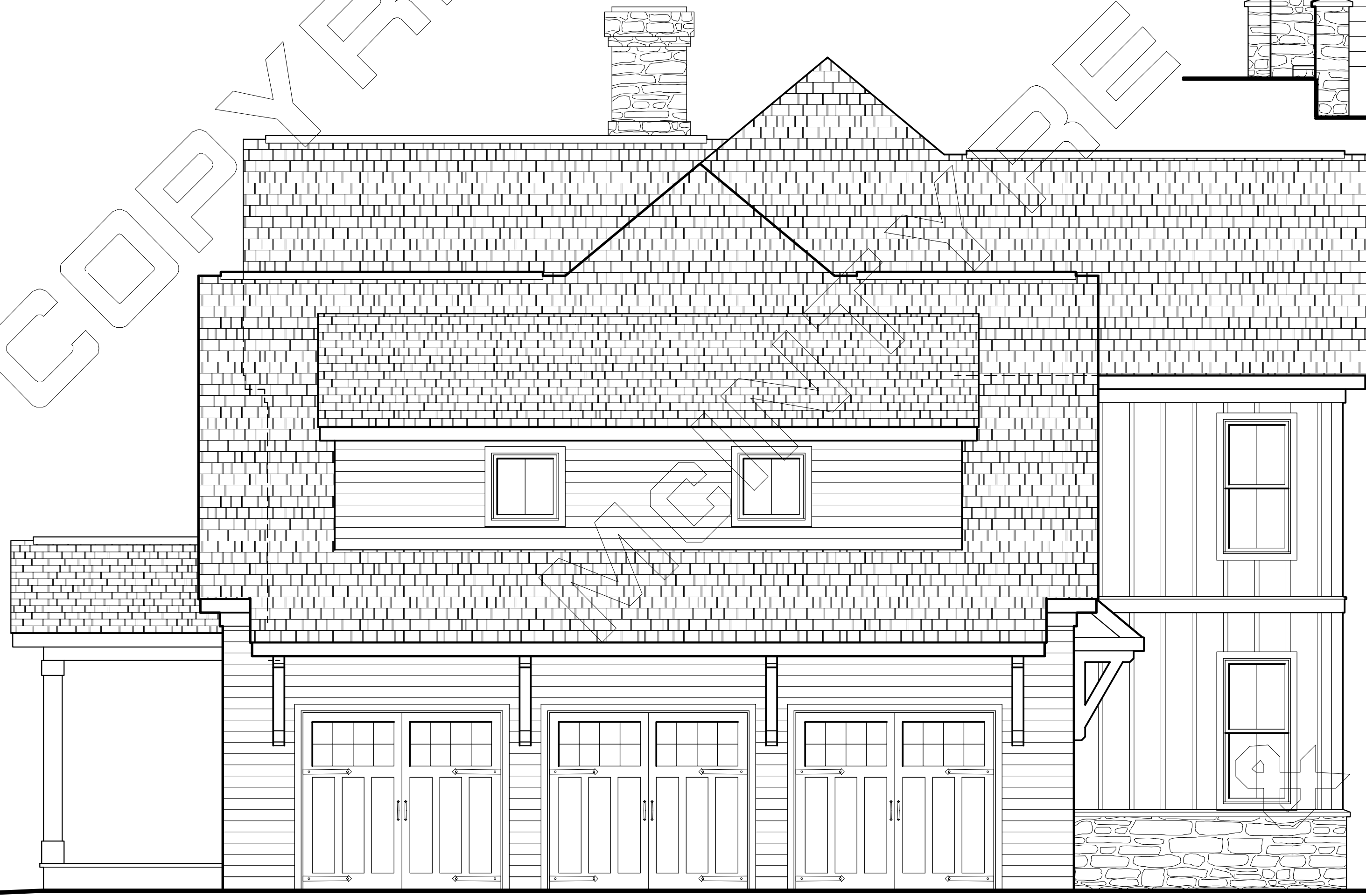
LEFT SIDE ELEVATION 1/4" = 1' - 0" \\boca\743parks\db\left.dwg