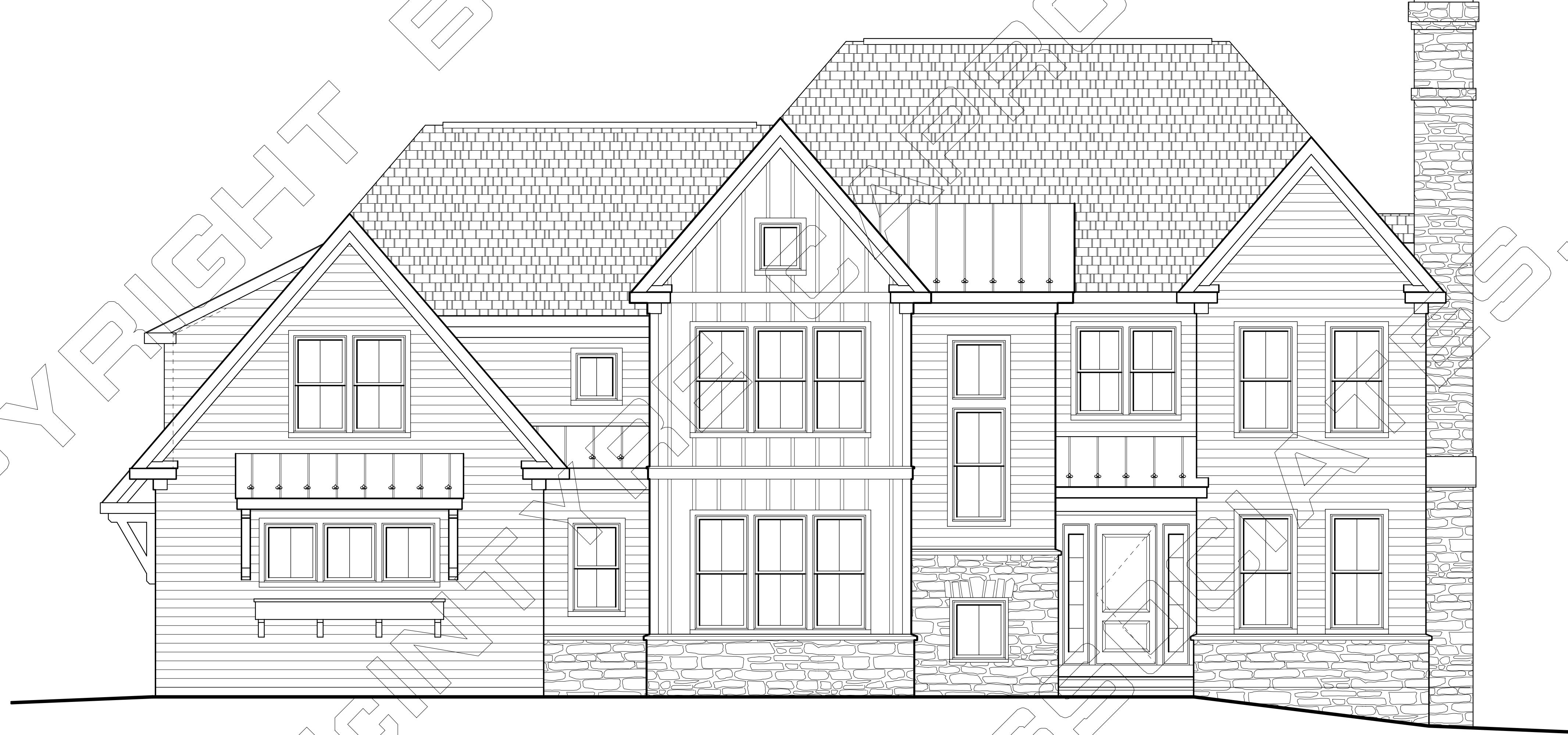
FRONT ELEVATION 1/4" = 1'-0" T:\boca\743parkes.dwg\front1.dwg

- REVIEW SET - 11 FEBRUARY 2020 - NOT FOR CONSTRUCTION -