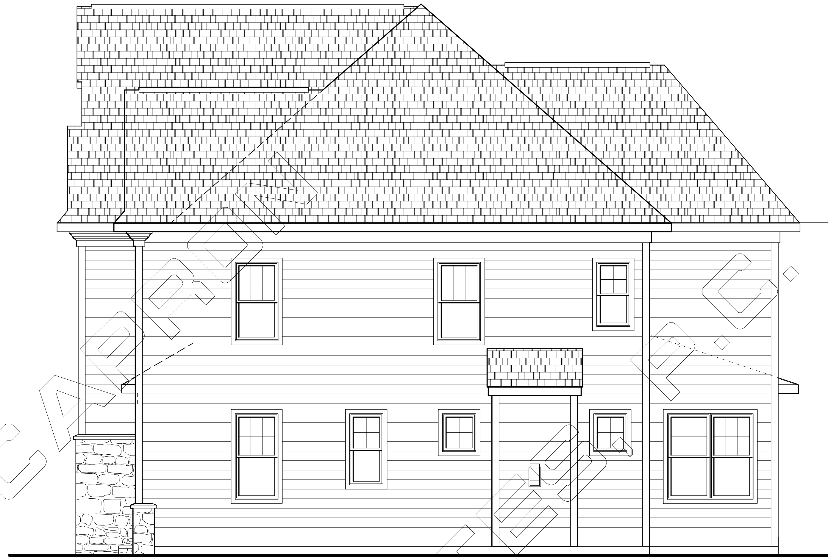
RIGHT ELEVATION 1/4" = 1' - 0" P:\misc\2b\shrub\right.dwg