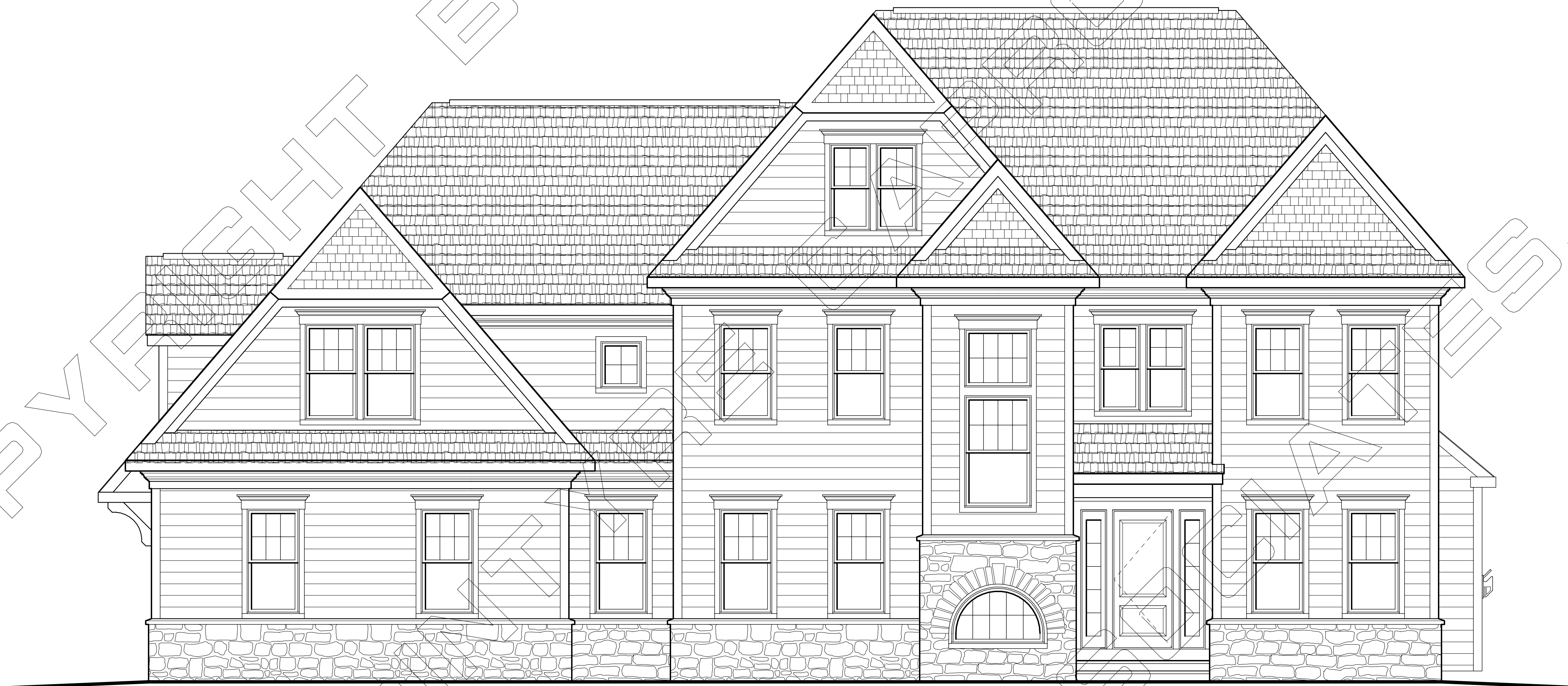
FRONT ELEVATION 1/4" = 1'-0" R:\hsc\2b\shirudo\front.dwg