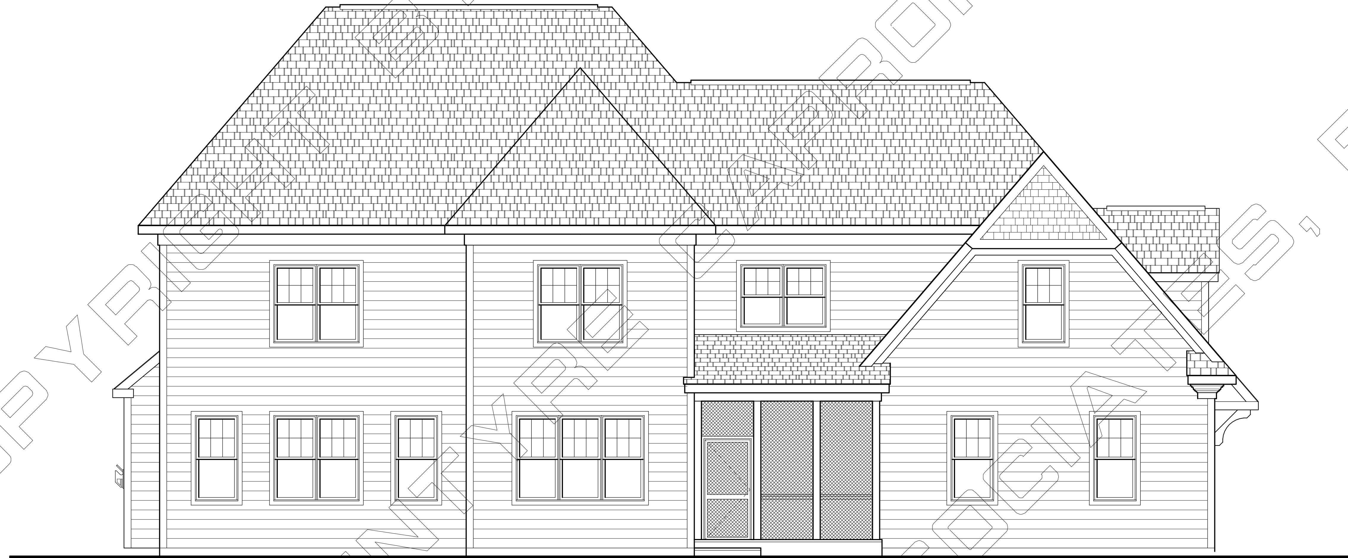
REAR ELEVATION 1/4" = 1'-0" t:\boca\rose\glen.ab\rear.dr