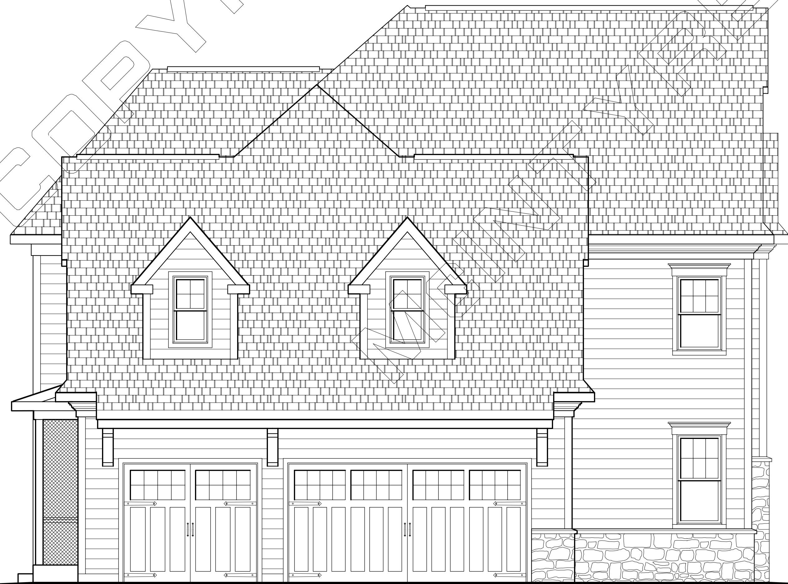
LEFT SIDE ELEVATION 1/4" = 1' - 0" P:\boca\roseglen.db\left.dwg